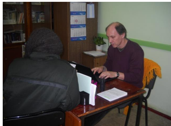
Social counseling in Ardatov female colony, December 2012.

In each colony we gave individual consultations to prisoners on social and legal issues. In Ardatov we have covered about 300 prisoners: 50 were given personal consultations during our visit in July and 150 in December. Over 100 letters were received from this colony for the second half of 2012.