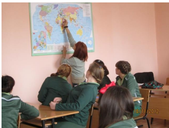
MCPR volunteer is giving presentation on everyday life in Italy. Ryazan colony, November 2012.

administration does not welcome much our involvement. So to continue our work with Ryazan colony is problematic. Instead we are to renew cooperation with Novy Oskol girls' colony that is to be reopened after reconstruction in mid-summer.