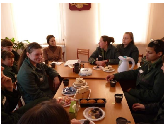
Group discussion in Chelyabinsk female colony, December 2012.

We do not have enough resources to deal with women prisoners in two Chelyabinsk colonies. In addition, the regional and colony administration do not want us much either. So we can hardly continue with Chelyabinsk.