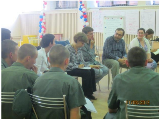
Theater.Doc in Mozhaisk juvenile colony.