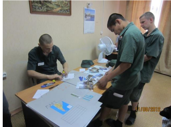
Mozhaisk juvenile colony, August 2012.

addition, Mozhaisk juvenile colony for boys has been visited on a monthly basis for rehabilitation goals through art and educational sessions.